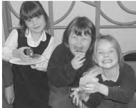
Pictures: From top - shoe parade; surfing safely; checking the cakes!