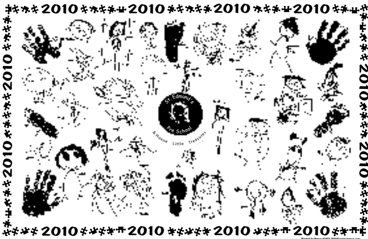
Hands on - the Pre-school tea towel.

We would also like to welcome you to the Little Treasures group which meets on Wednesdays at the village hall 10am-12noon. This is a group for parents/carers to stay and play with their children (from 0-5 years old).