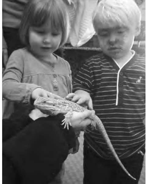
At the zoo - waves from the train; hands on with a lizard.

closely with St Edmund's Primary School to support the children's transition into school.