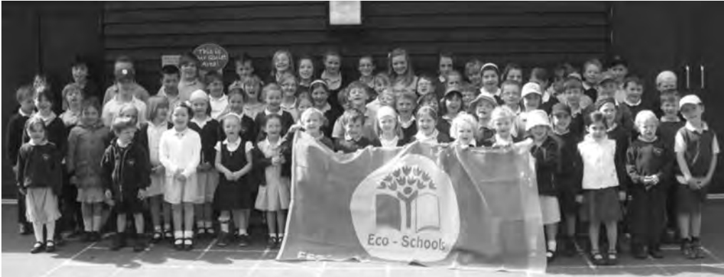
Above: Green Flag displayed; below, left: the Royal wedding party and right, viewing the pigs at Suffolk Farm Fair