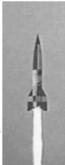
Above - a V1 doodlebug; right, a V2 rocket